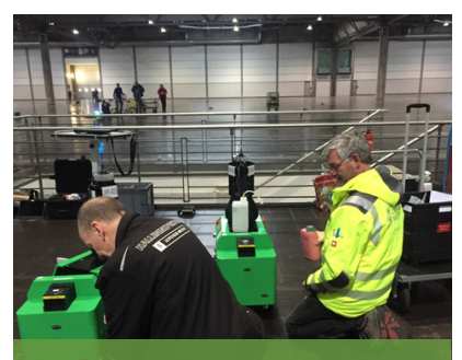
In-Person Practical Training